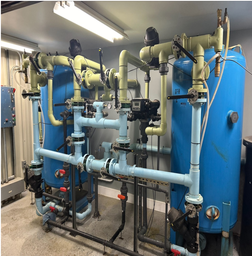
Grindstone Arsenic Removal Media Vessels