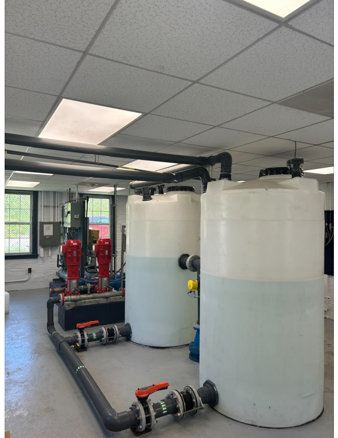
Grindstone Equalization Tanks (prior being pumped into system)